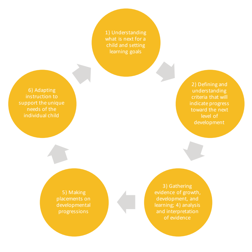
Figure 5. The Authentic Assessment Cycle

Authentic assessments help teachers observe the progress children are making through a process of gathering evidence of learning as it emerges naturally throughout the course of typical classroom activities. Evidence documented by teachers is then used to assess where children are on a progression and then to support further development along the progression. In this way, GOLD^* supports assessment "for" learning and assessment "about" the learning process, and not just assessment "of" the results of learning (Heritage, 2013). The authentic process of formative assessment has often been described as a continuous cycle of activities that are part of everyday instruction (Heritage, 2013). This cycle is often outlined in phases, as illustrated in Figure 5.