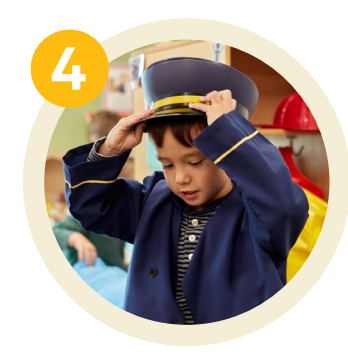
There are places you can be by yourself.