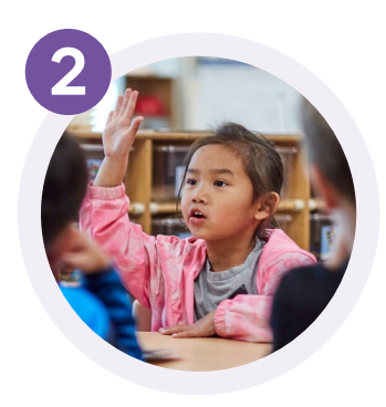
You belong here.