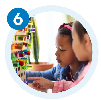
This is a safe place to explore.