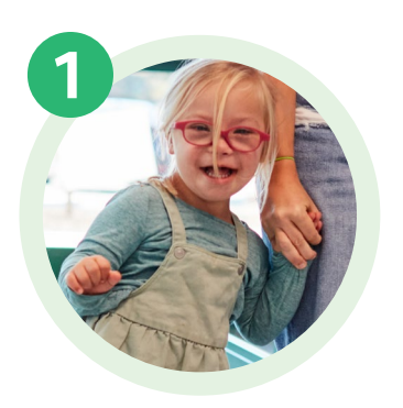
This is a good place to be.

Learn more about how to send positive messages in the eBook Six Core Questions at the Heart of a Classroom Community